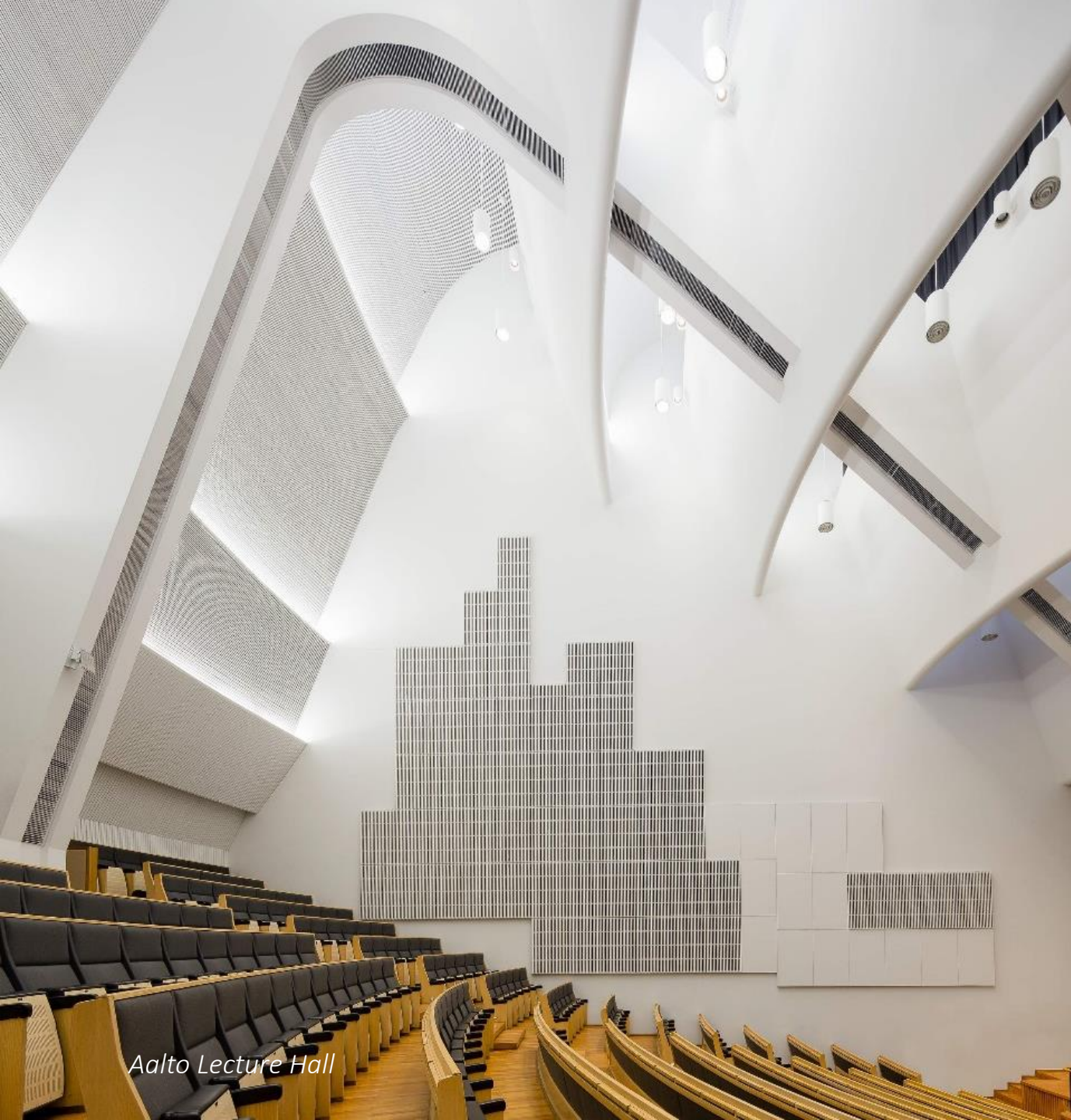
Aalto Lecture Hall