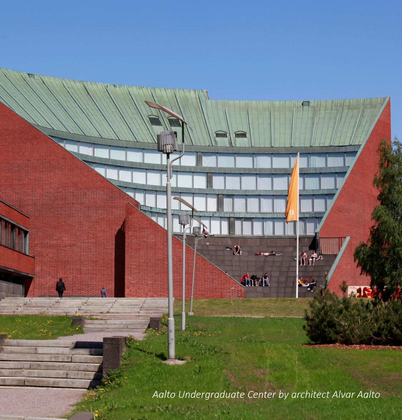
Aalto Undergraduate Center by architect Alvar Aalto